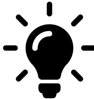
Innovation & Entrepreneurship