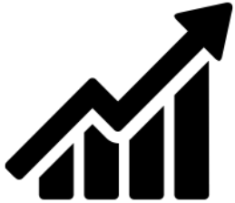
Business Investment Services